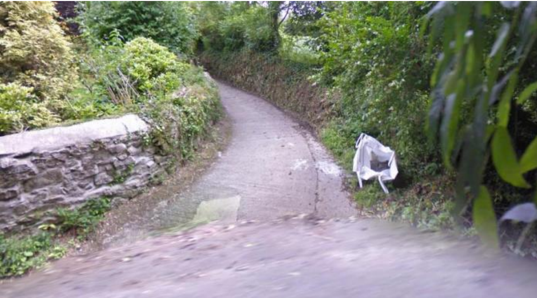
Southeast End - Overgrown when photo taken