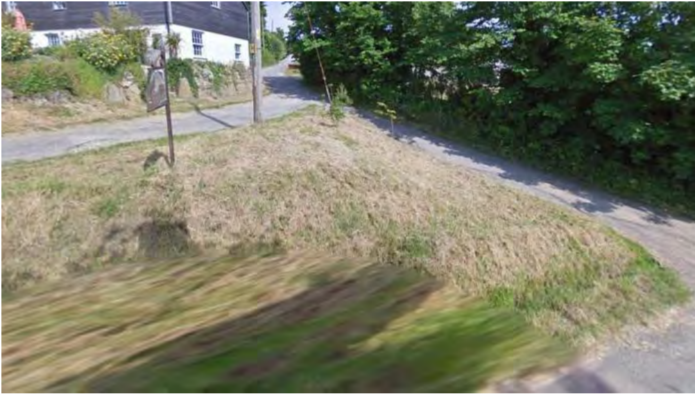
Bridleway viewed from County Road C0025