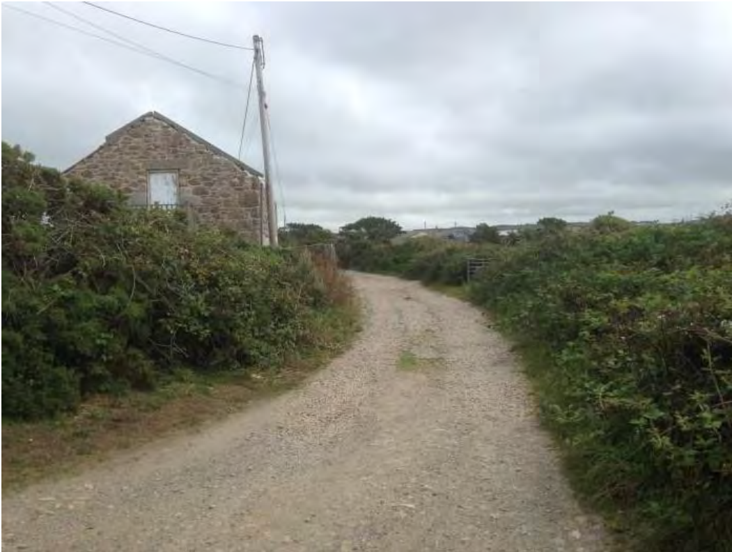
Exit onto B3306 - note actual route crosses grass