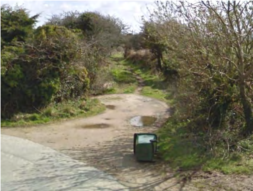
Entrance at eastern end (left of the gate)