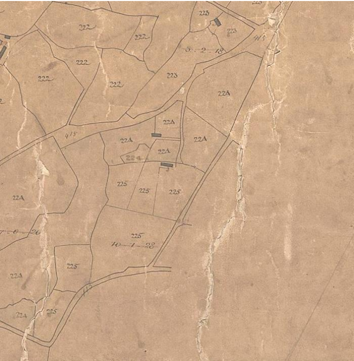
plot 415 omitted as being Road and Waste