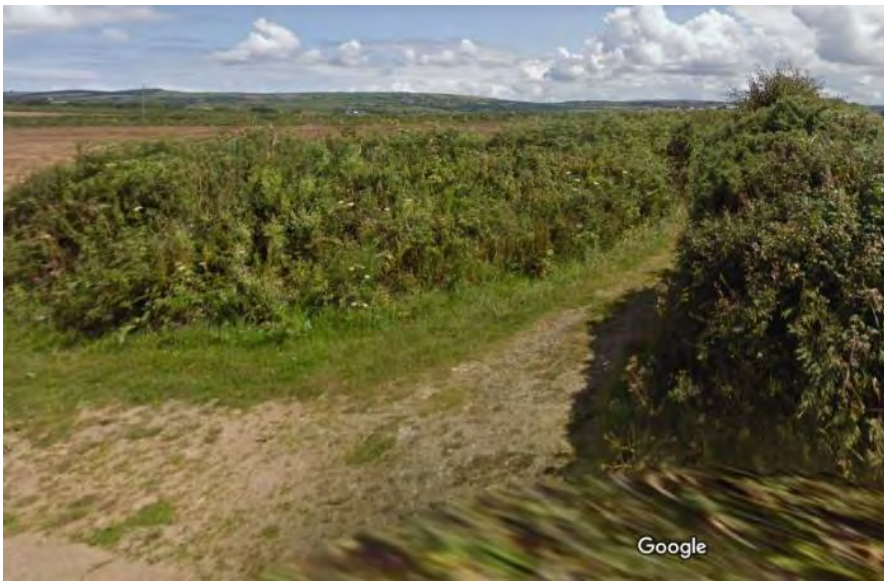
View off Squires Lane

OS One Inch Ordnance Survey Maps - One-inch England and Wales, 1888 to 1913