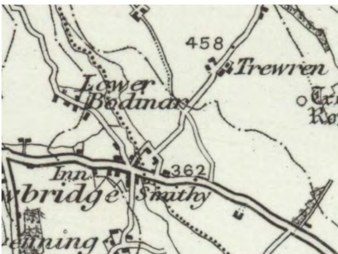
Clearly shown as road