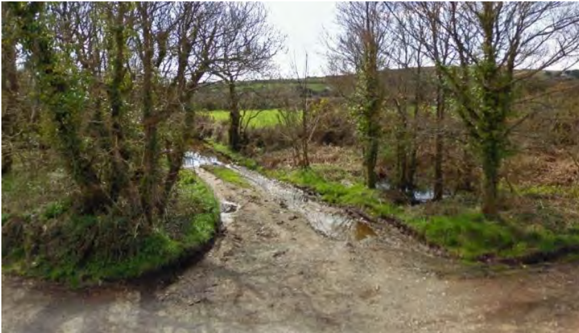
View from A3071