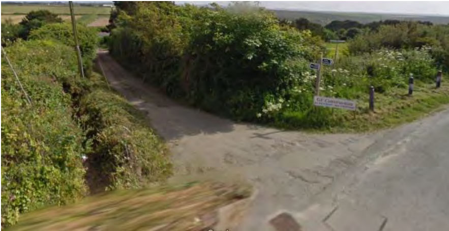
Exit onto U6056