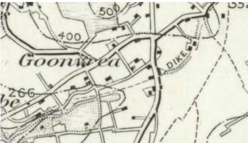
Clearly shown as a road